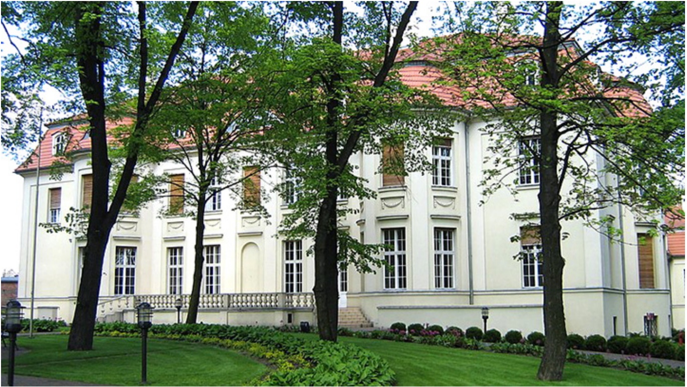
Pałac Alfreda [redacted] w Łodzi

[redacted] [redacted] [redacted] [redacted]