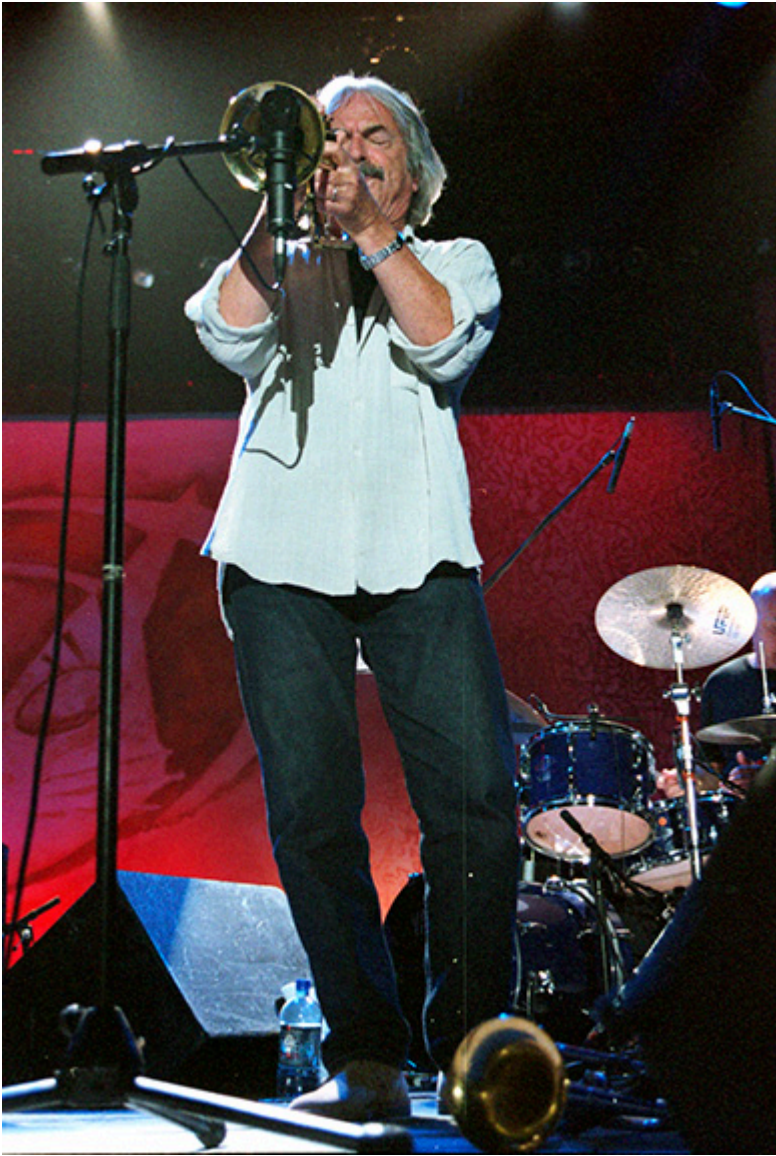
Enrico Rava, Montreal. 2001.