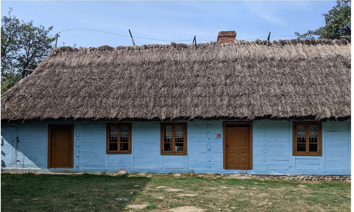
Lipce Reymontowskie, a historic peasant cottage located within the Władysław Reymont Museum