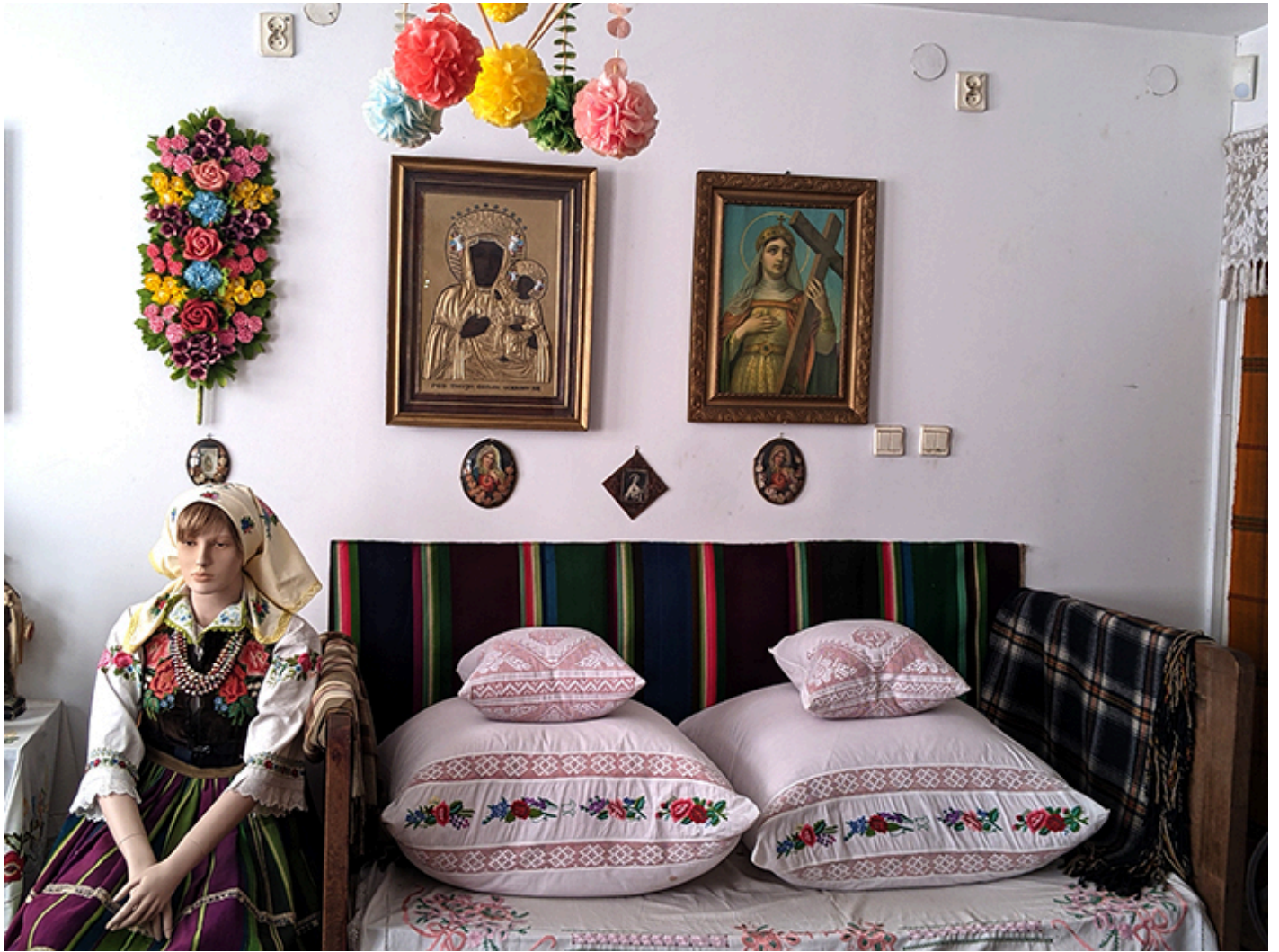
The Władysław Reymont Museum in Lipce Reymontowskie