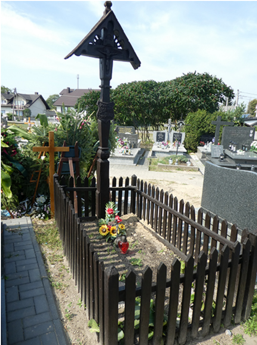
The symbolic grave of Maciej Boryna at the cemetery in Lipce Reymontowskie