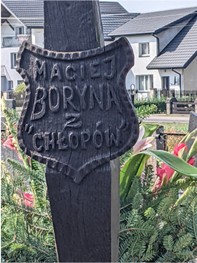
The symbolic grave of Maciej Boryna at the cemetery in Lipce Reymontowskie