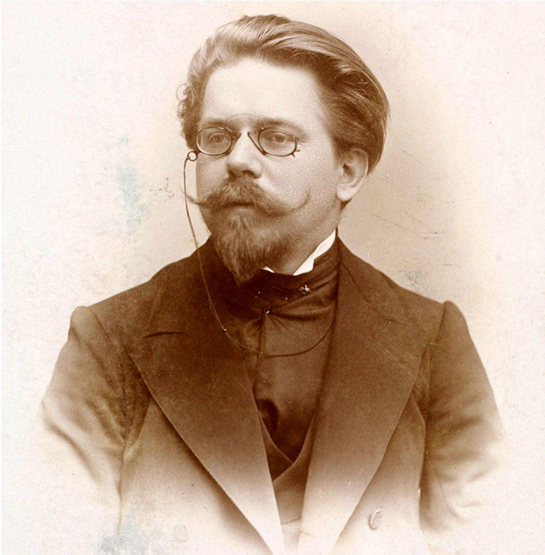
Władysław Reymont, circa 1897

Władysław Reymont, born on May 7, 1867, as Władysław Stanisław Rejment in Kobiele Wielkie, within the Russian Partition, spent his youth during a time when Poland was divided among three empires. Artistically connected with the Young Poland movement, he drew inspiration from the lives of ordinary people and the Polish countryside. In his works, such as The Promised Land and The Comedienne , he portrayed not only the beauty but also the hardships and injustices that were the daily