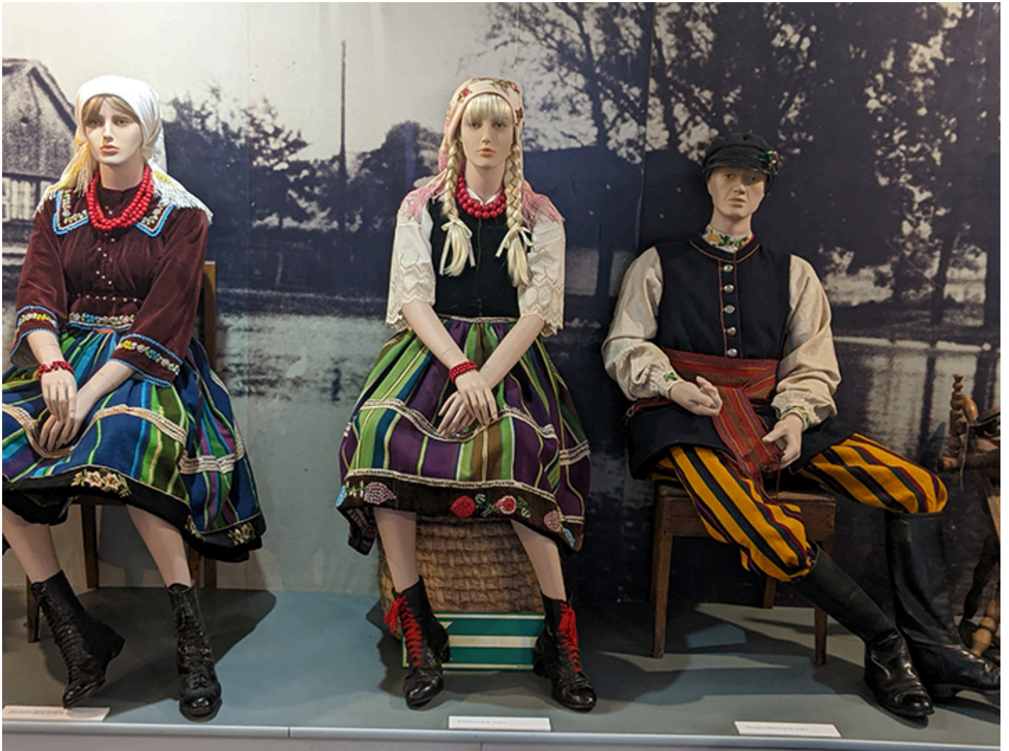
The Władysław Reymont Museum in Lipce Reymontowskie